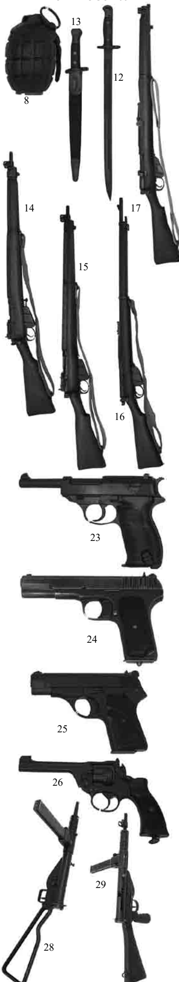
Photographs not necessarily to scale

NZ Military Lee Enfield NO2 bolt action rifle. 30" 303 cal barrel with bayonet lug and original sights. The chamber is NZ marked and the wrist is marked Crown/VR BSA etc. 1895 II. Metalwork with thinning original blue, bolt and rifle have matching numbers. VGC woodwork with NZ marked brass butt plate and lobbing sight. Includes webbing sling and original chained magazine. VGWO&C ALR