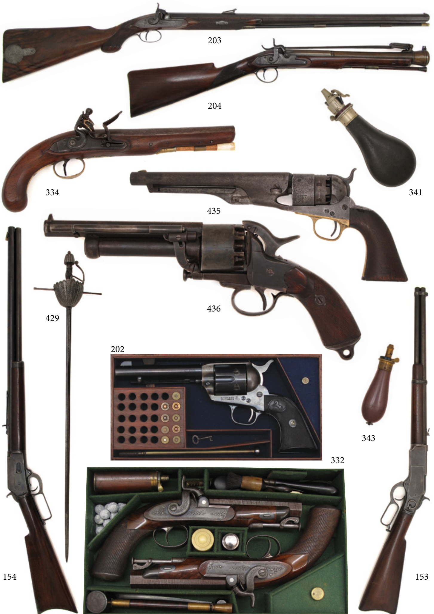
Items Not Necessarily to Scale