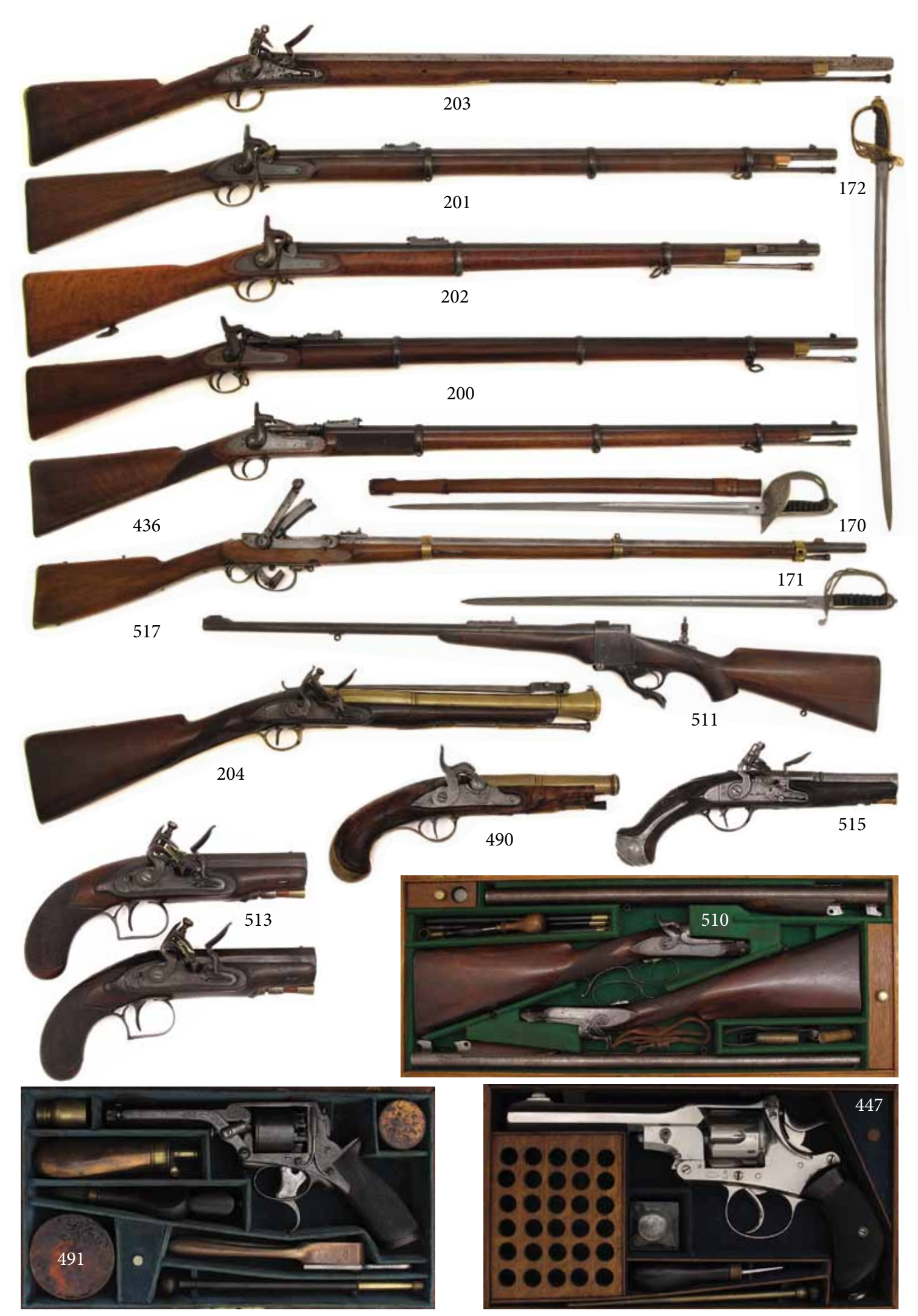
Items Not Necessarily to Scale