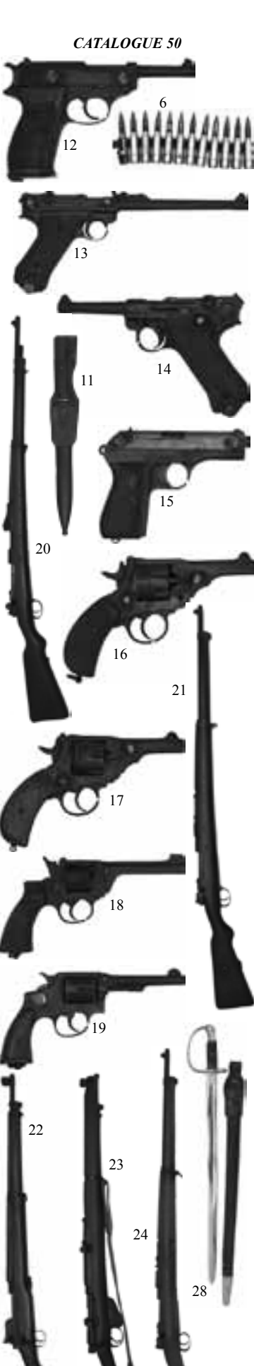
Photographs not necessarily to scale

Note: Buyers premium is now 12% This is our only increase in 25 years of auctions.