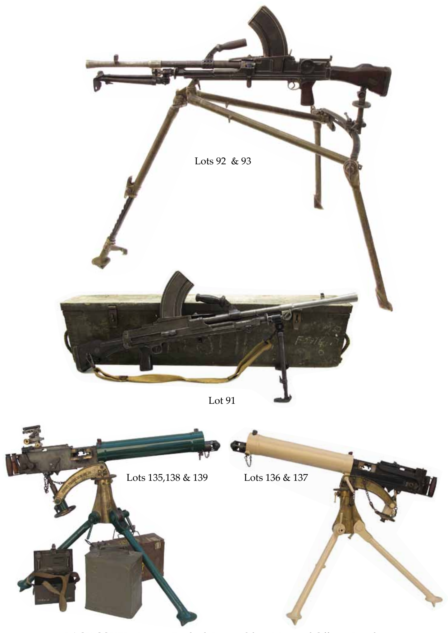
BACK COVER: Lot 512 Fredrick Barnes Silver Mounted Officers Pistols