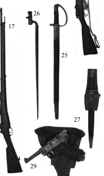
Photographs not necessarily to scale