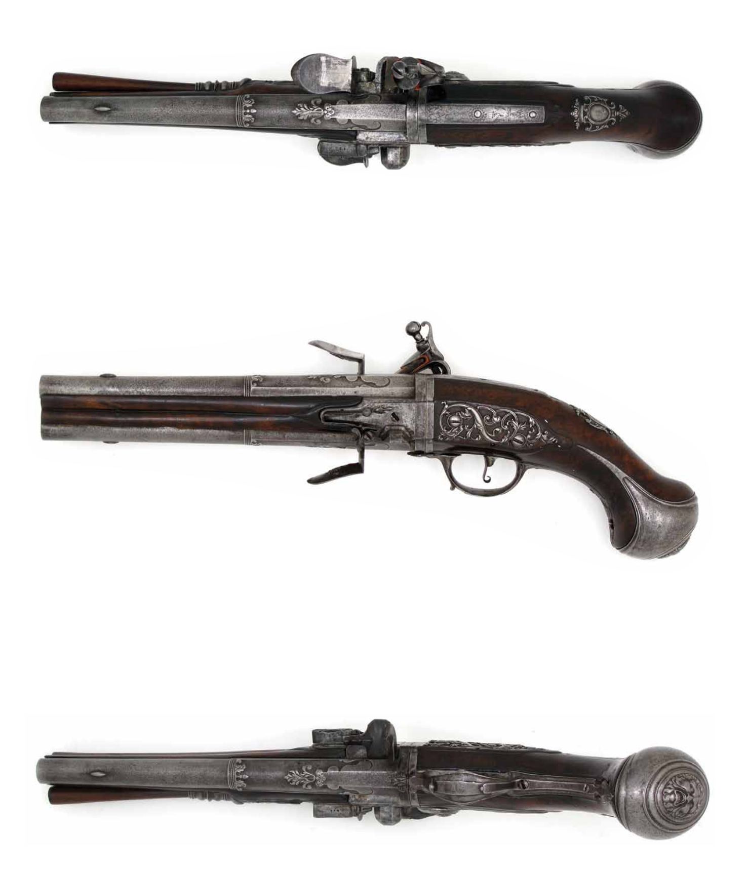
Lot 298 - Double Flintlock Superimposed Turnover Pistol circa 1690