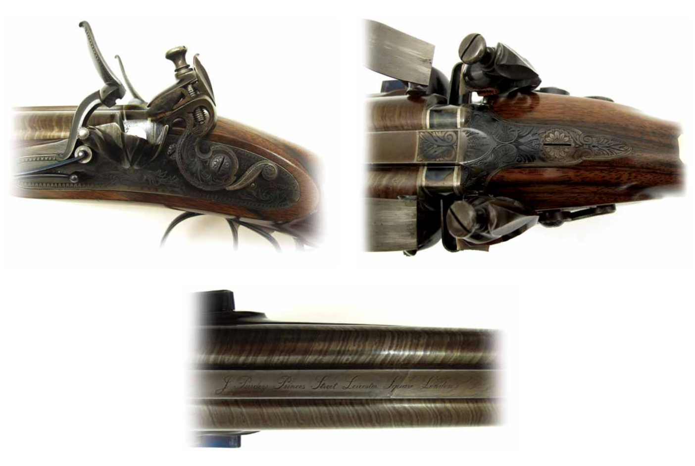
Lot 179 - James Purdey Double Flintlock Fowling Piece