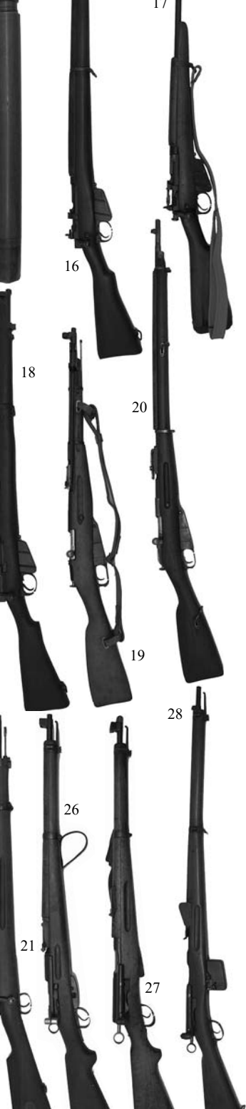
Photographs not necessarily to scale