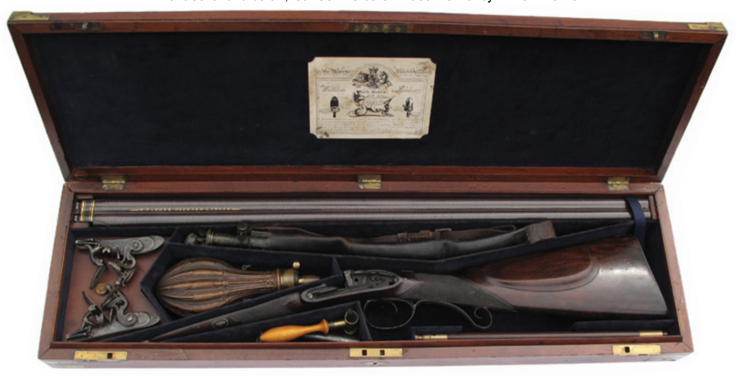
Lot 132 - Calisher & Terry .40 bore double rifle